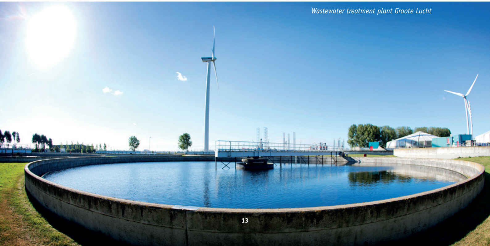
Wastewater treatment plant Groote Lucht

More about the feasibility studies carried out and the pilots mentioned above can be read below.